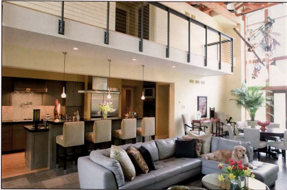
The layout of the first floor keys into the homeowners' love of cooking and entertaining. The display kitchen enables them to cook and enjoy the company of their guests, who have the option of sitting at the bar or lounging on the leather sectional sofa. Overhead, an open walkway provides access to second-floor guest rooms.

As for the architect who was ultimately selected to carry out the project, the homeowners found their guru in Jeff