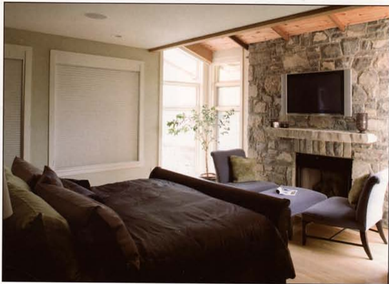
The master bedroom provides a quiet and cozy getaway. Here, too, the goal was to unite the indoors with the outdoors through using stone and incorporating a number of windows into the design (the windows on the left look into the transitional room).