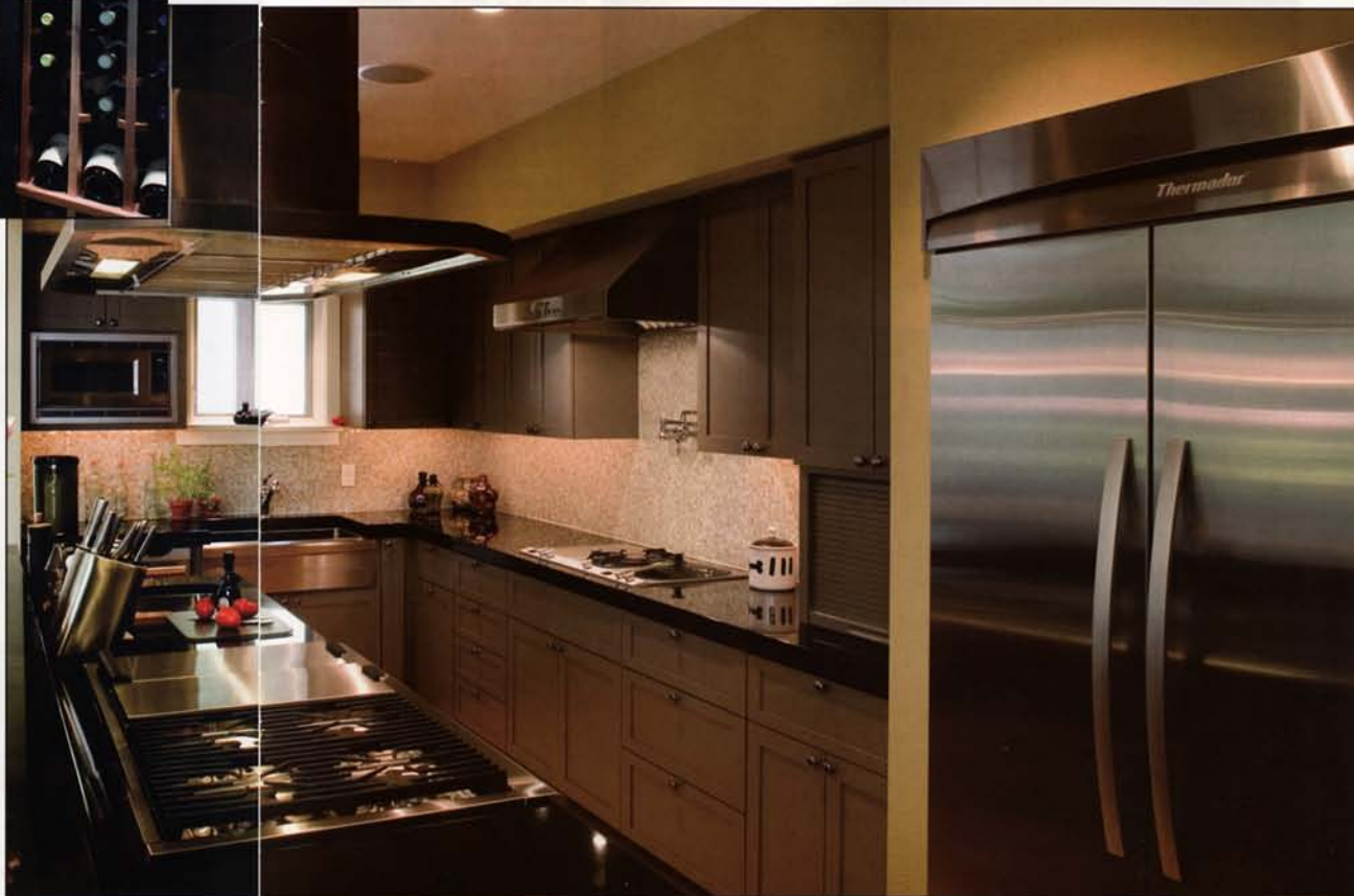
The kitchen is state-of-the-art from an appliance perspective.