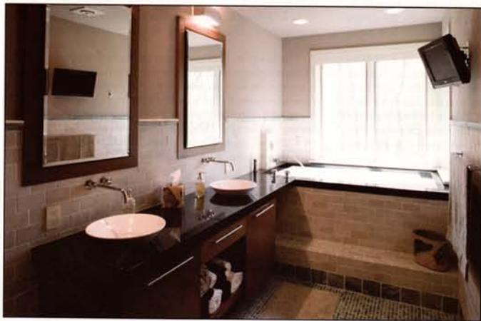
The Zen-like master bath is outfitted with his-and-her vessel sinks, a walk-in glass shower and a soaking tub.