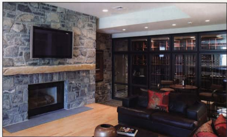
The highlights of this "grown-up" rec room include a billiard table, a stone fireplace, a flat-screen television, a humidor and a wine cellar whose design is based upon one found in a restaurant at the Culinary Institute of America's Napa Valley campus.