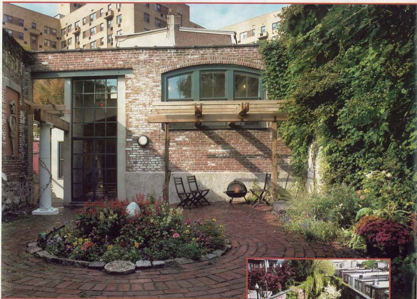
Above: New and old blend where an enclosed garden meets an addition to a Fairmount rowhouse. Inset: The back yard before construction.

ROWHOUSE ADDITION EMBRACES AN INDUSTRIAL RUIN IN THE BACKYARD