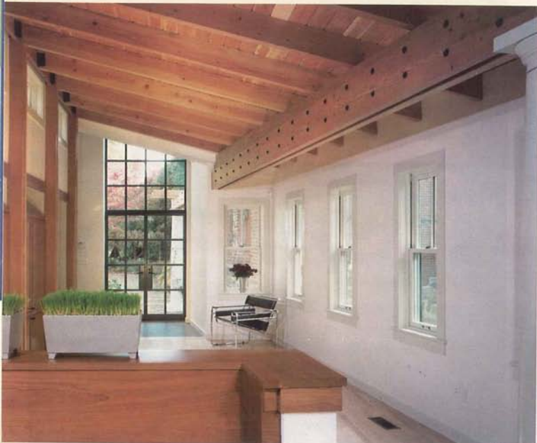
The addition focal point is a floor-to-ceiling view of the garden.