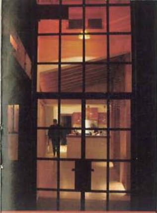
A steel door/window unit opens into the addition.

When the young couple and their four children moved into the "Centennial house," a stately rowhouse built in 1876 in the city's Fairmount section, they were intrigued by the home's unique backyard feature: a "secret garden" fashioned within the ruins of an old cement factory.