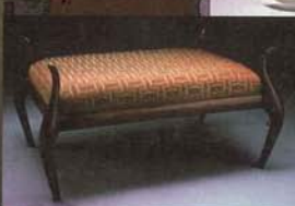
Patrycja B. Rymiec - Booth #205